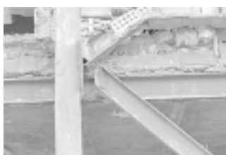
Separation of x-bracing elements from the column due to poor quality of welding

One common problem that was observed in several buildings in the city was the formation of soft stories. Other problems were related to inadequate design and poor detailing. For instance, the connection plate of x-bracings to the beam-column joint did not have enough dimensions and/or the welding at the interface of the connection plate and column was not adequate. Consequently, the bracings were cut from the beam-column joint during the earthquake. This, in turn, led to a lateral stiffness decrease of the corresponding story and caused the change of the location of the rigidity center, generating additional undesirable torsion to the building. Another major problem in steel connections was poor quality of welding. This came from lack of trained workmanship to perform appropriate welding during the construction process.