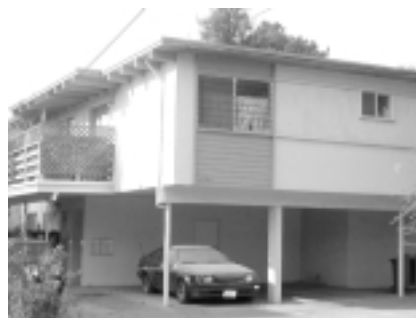
Soft-first story building

With slight changes due to administrative differences, I believe that there is a large benefit of adopting similar strategies in the Japanese system that have proven so successful in promoting private building retrofit in California.