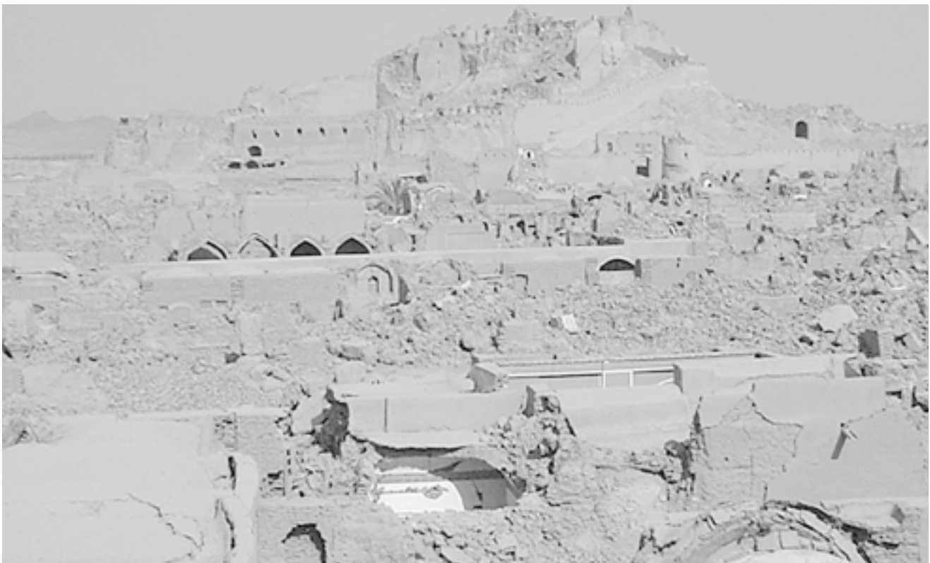
Earthquake-damaged view of historical adobe citadel (Arg-e-Bam)

On December 26, 2003 at 01:56:56 GMT (05:26:56 a.m., local time), a destructive earthquake hit Bam City (29.09 N, 58.35 E) in Kerman Province, SE Iran. The Bam Earthquake caused numerous casualties (more than 45000 dead) and extensive damage to different types of buildings. Considering the earthquake focal distance was around 7 km, the buildings in Bam experienced a near-source earthquake. The majority of buildings were made with adobe and mud. In fact, the worldwide fame of Bam is due to its historical adobe houses. The most ancient adobe citadel in the world (more than 2000 years old) is located in this city and was severely damaged in this earthquake. The other building structural types include: un-reinforced masonry (URM) building, confined masonry building, steel frame, and reinforced concrete frame. In this article, building damage in terms of their structural types is discussed.