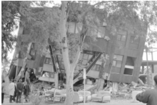
Tilt of building due to soft story formed in the first floor

walls at the intersections can be maintained.