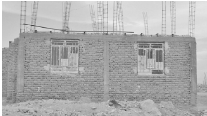
Vertical and horizontal ties maintain the stability of building

This type of building demonstrated good seismic performance. As indicated in Standard No. 2800, in all structural walls of all masonry buildings, one or two stories, irrespective of whether they are constructed with bricks, cement blocks or stone, confining ties must be constructed. Vertical and horizontal confining ties provide integrity for the building and make a seismic-resistant structure. By constructing tie-columns in the main corners of the buildings, the connection of