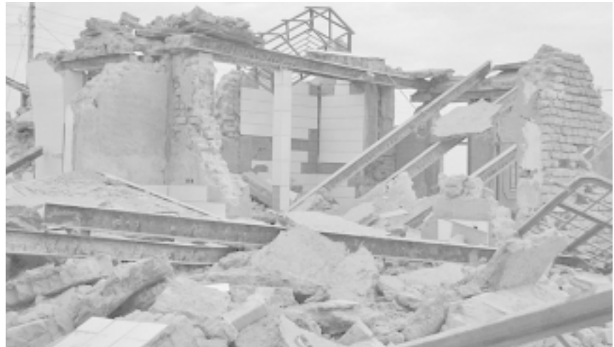
Failure of unreinforced masonry walls and collapse of roof beams

prohibites new construction of adobe buildings, there is still a question about what we can do with the existing adobe houses, which are extensively distributed in rural areas in the country. It is recommended to conduct research on developing effective and cheap retrofitting techniques for adobe buildings.