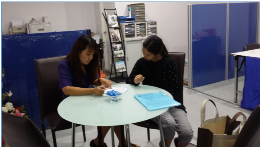
Interview at a modern condominium for middle-class

RNUS have conducted questionnaire survey for 200 collective housings (apartment and condominiums) in urban area of Thailand between July and October 2017 in Bangkok metropolitan and the suburbs. Also, we interviewed apartment / condominium managers, residents and staff persons in those collective housings about their view on flood. The purpose of the research is to analyze current status of flood mitigation measures taken by urban housings and the shift of attitudes according as people's lifestyle. The result of the survey and suggestions will be published in journal.