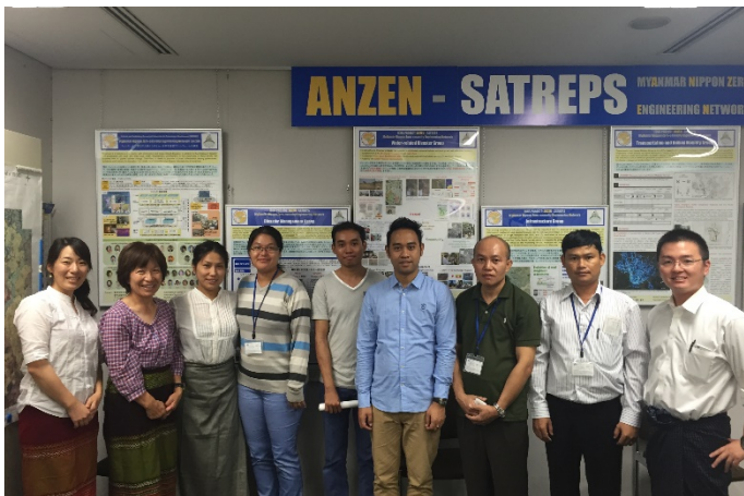
At ICUS lecture room exhibiting the SATREPS project posters during the IIS Open House, with Myanmar and Japanese project members