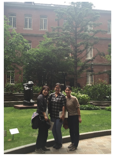
Visiting the example of Heritage building reinforced and reused near Tokyo station